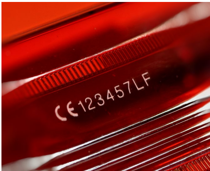
Glass & transparent plastics