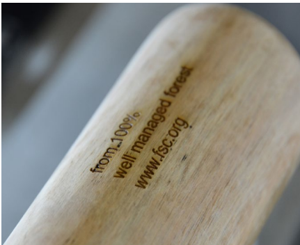
Marking on wood