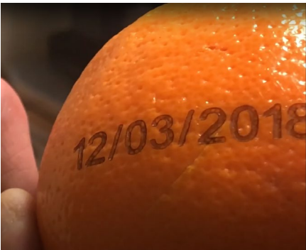
Fruits & vegetables marking