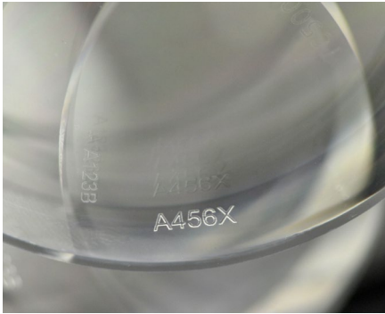
Marking on labels