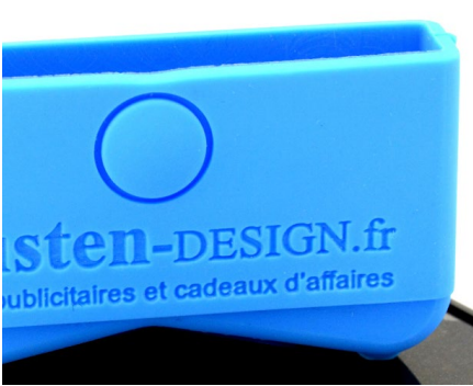
Non-contrasted marking on plastics