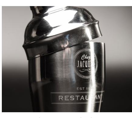
Gifts & personalization