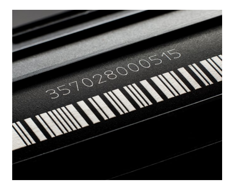
Contrasted marking on plastic